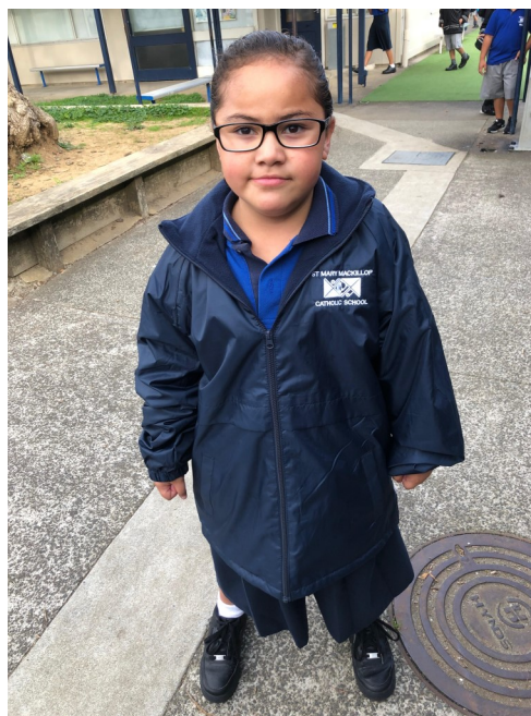
New school Jacket Purchase it from NZ Uniforms