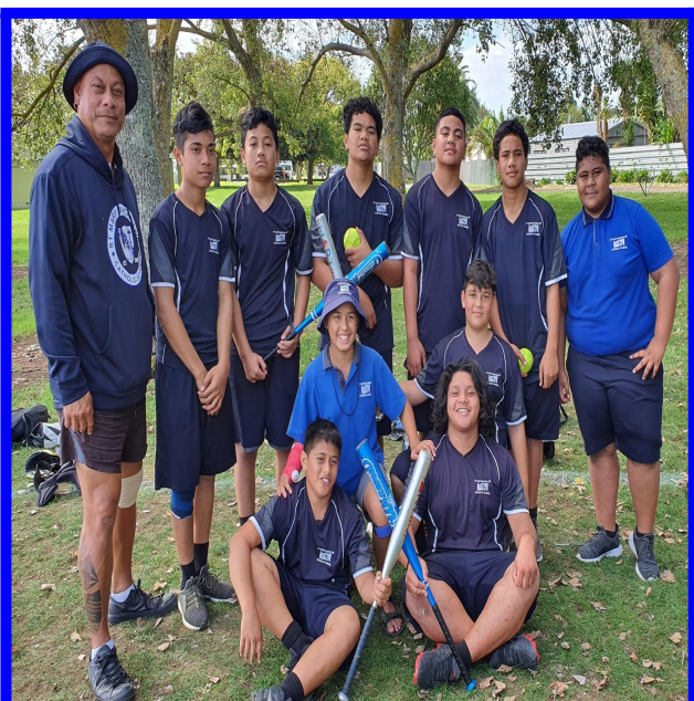
Picture: 2021 South West Zone Champions

Come down to Aorere Park on Tuesday 28th February where our Year 7&8 Boys will be competing in the South West Zone Softball Tournament. St. Mary MacKillop Boys were 2021 champions, with the 2022 tournament having been cancelled due to covid restrictions. Our Year 7&8 Girls have their tournament in Week 6 on Tuesday 7th March, also held at Aorere Park.