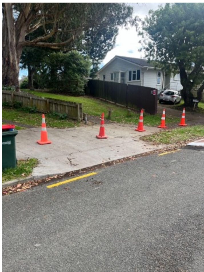
This is not a Car Park !!!!