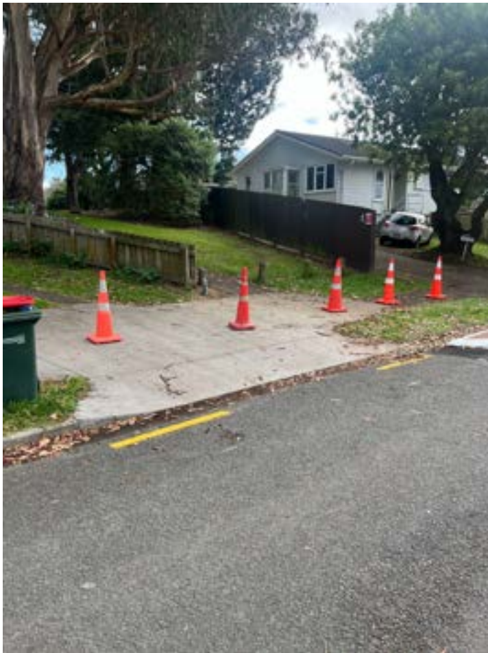
This is not a Car Park !!!!